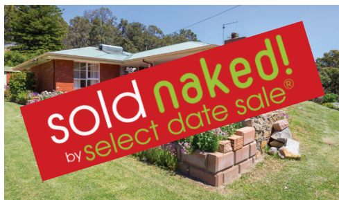
307 Albany Highway, Bedforddale