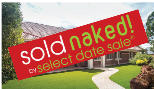
37 Waterwheel Road North, Bedforddale

Call or SMS me today on 0439 998 867 to find out more!