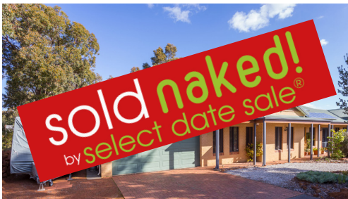
6 Blissett Drive, Bedfordale