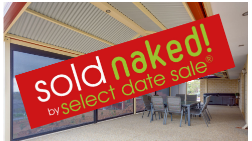
3 Kimber Rise, Bedfordale