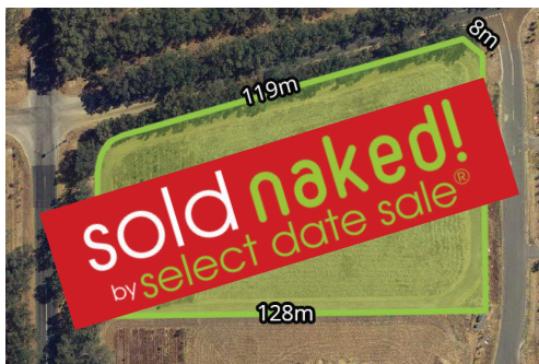
4 Stademey Street, Oakford