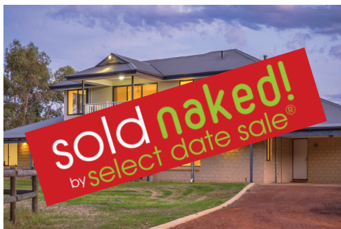
58 Kentucky Drive West Darling Downs