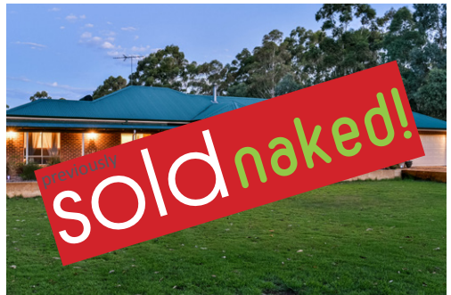
11 Lorenz Way, Oakford