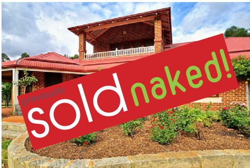
52 Empire Rose Court, Darling Downs