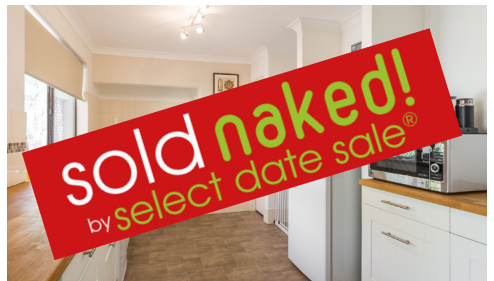
12 Incana Road, Kelmscott