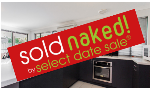
7/18 Mountain View, Kelmscott