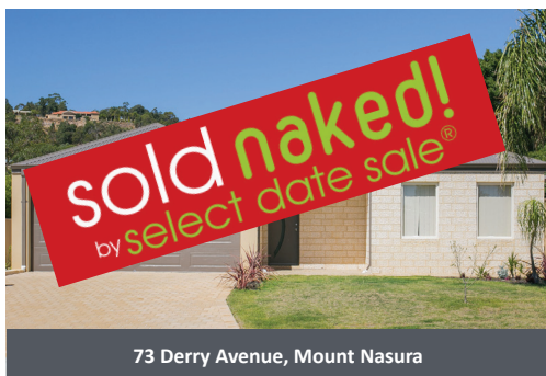
73 Derry Avenue, Mount Nasura