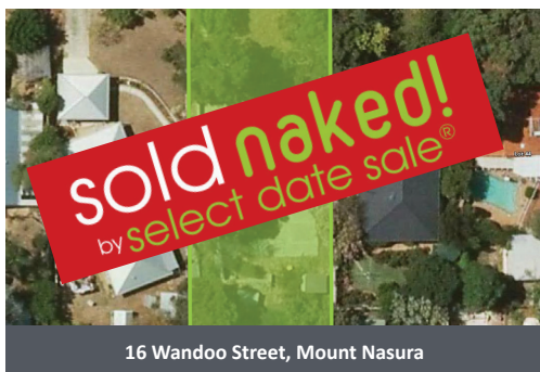
16 Wandoo Street, Mount Nasura