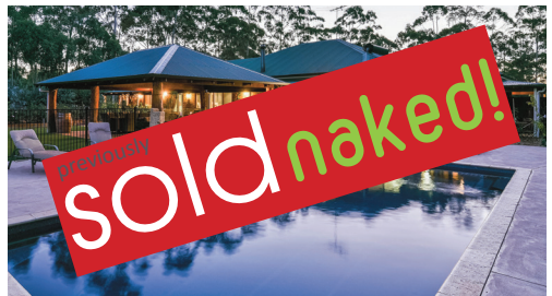
11 Lorenz Way, Oakford