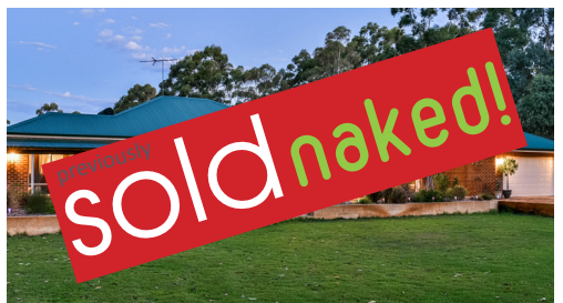
11 Lorenz Way, Oakford