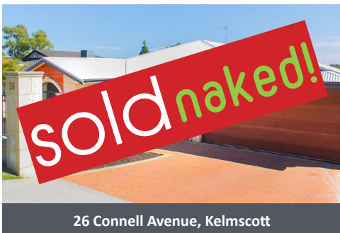
26 Connell Avenue, Kelmscott