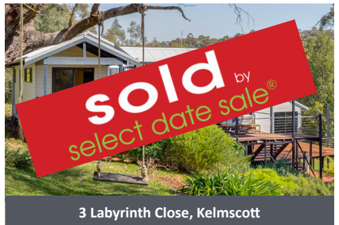
3 Labyrinth Close, Kelmscott