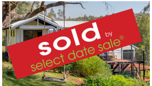
3 Labyrinth Close, Kelmscott