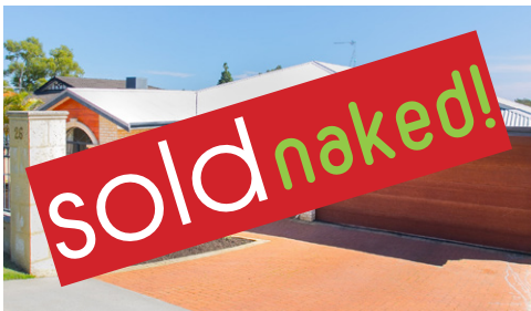
26 Connell Avenue, Kelmscott